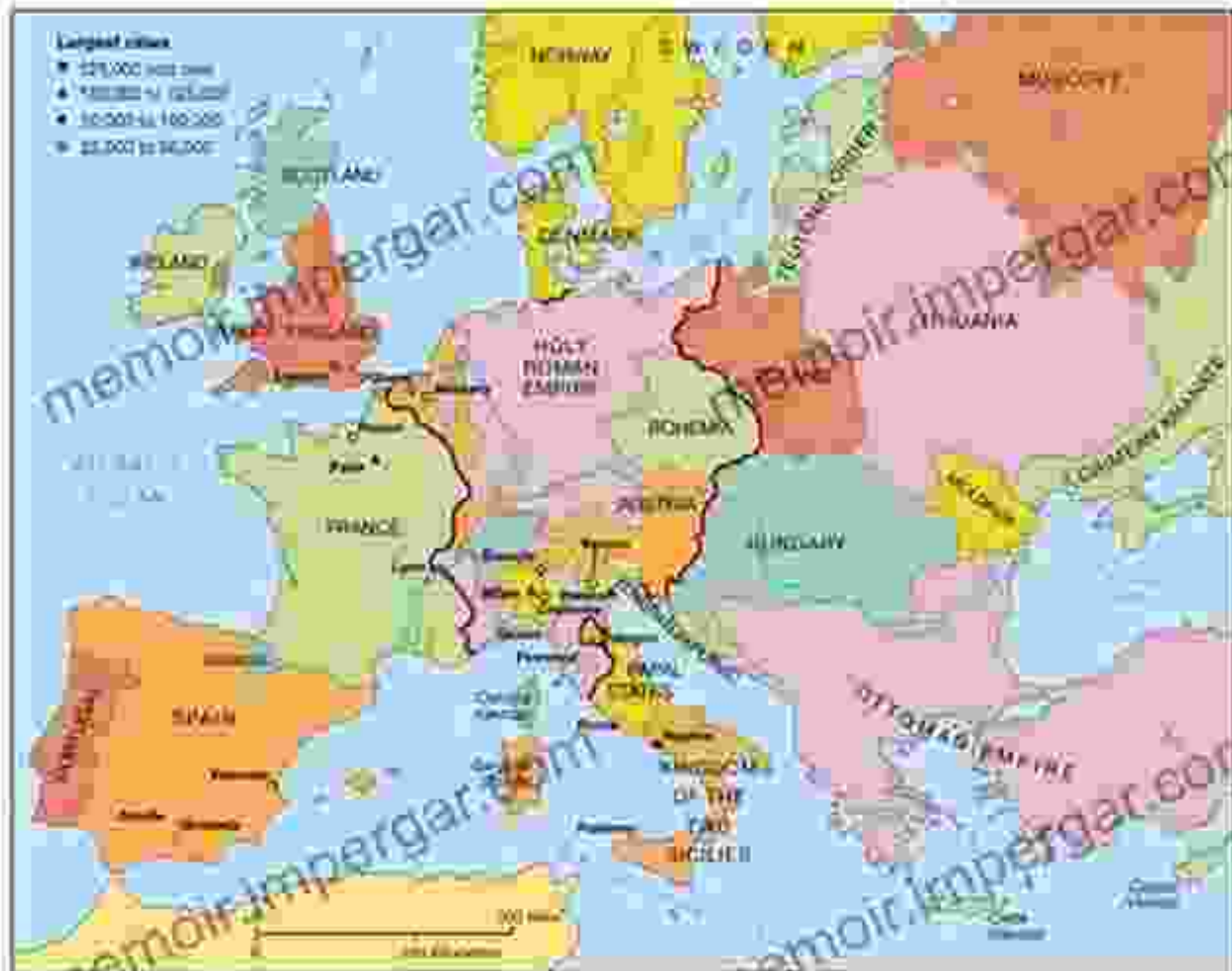
Europe's Cities in Western Europe, ca. 1500. There were no more large cities in the Middle Ages than in the rest of the world.