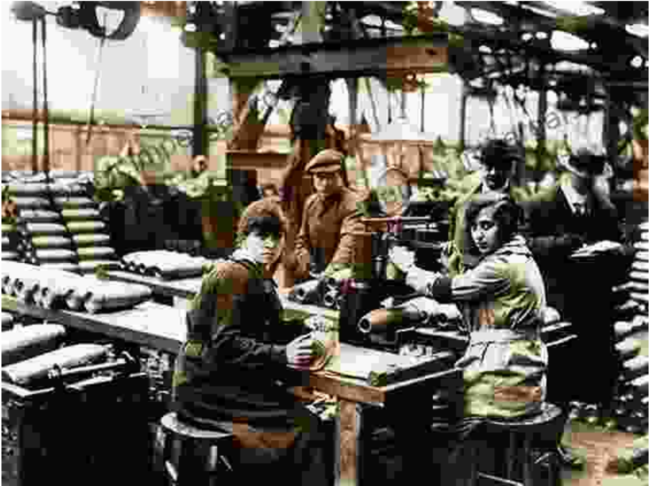
A group of women working in a munitions factory in Bridgnorth.