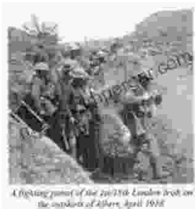
A fighting point of the 2nd/1st London Irish Rifles in the trenches of Albert, April 1918