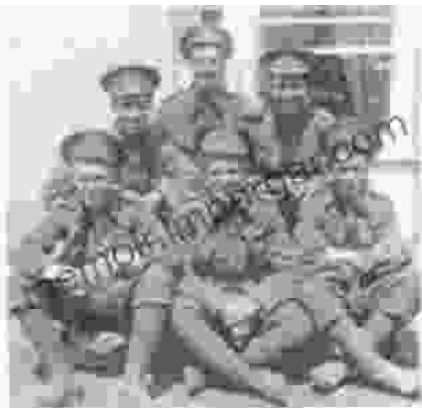
Remnants of the 1st Battalion London Irish Rifles, 1918