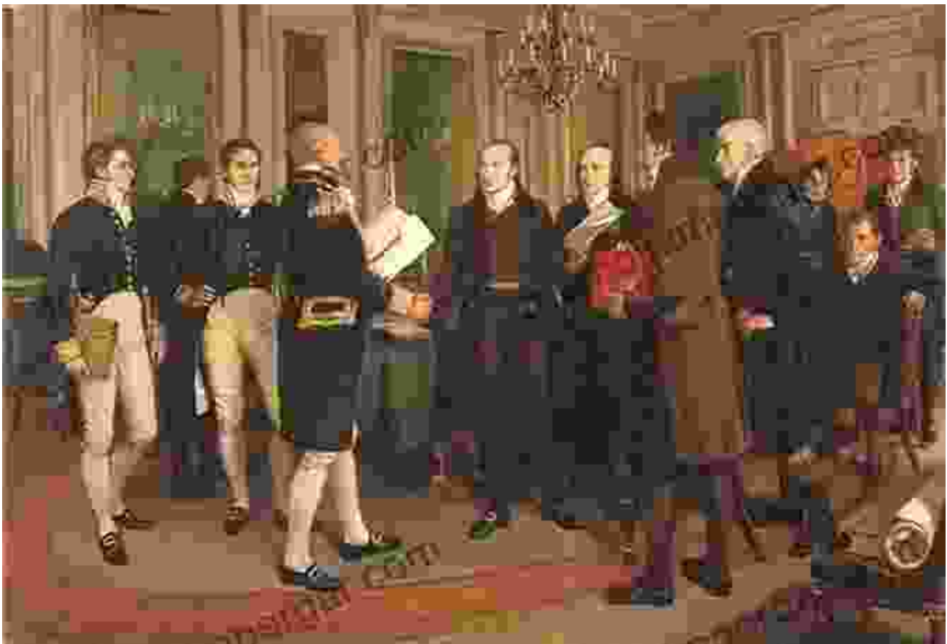
The Peace Treaty of Ghent