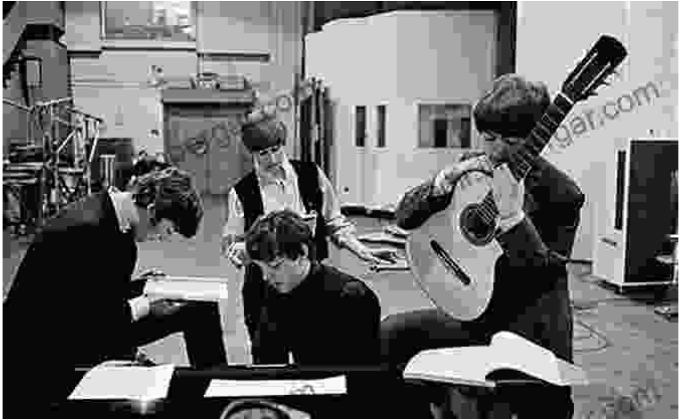
A behind-the-scenes look at the Beatles' creative process in the recording studio.