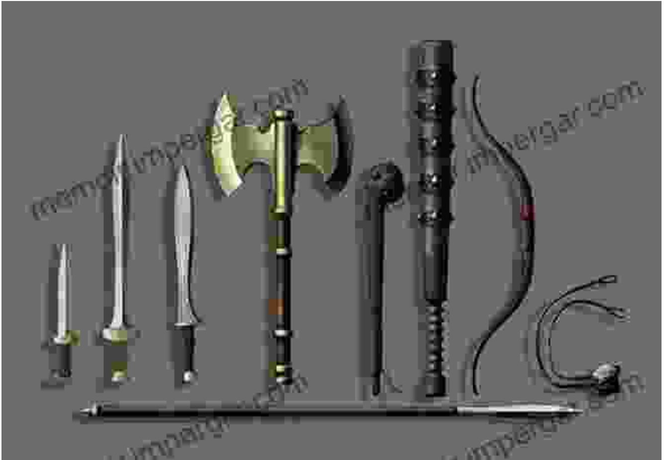
Bronze Age artifacts