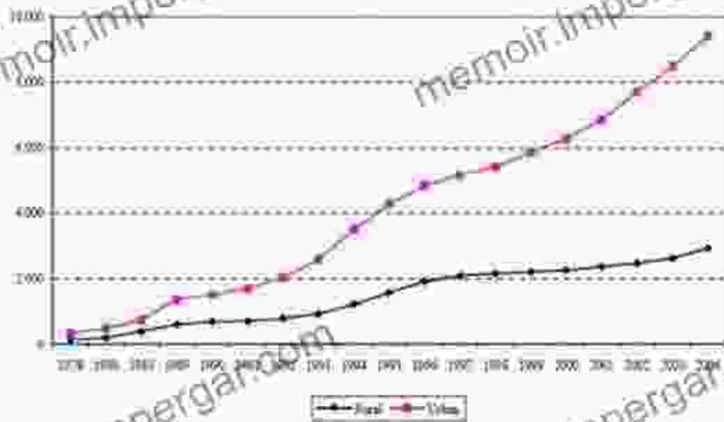
Figure 1. Per Capita Annual Income of Chinese Urban and Rural Residents, 1978–2004 (yuan)

Economic factors play a crucial role in perpetuating housing inequality. Our analysis investigates the dynamics of the real estate market, including land policies, housing prices, and speculative behavior. We discuss the role of government interventions, such as public housing programs and rent control measures, in shaping access to affordable housing.