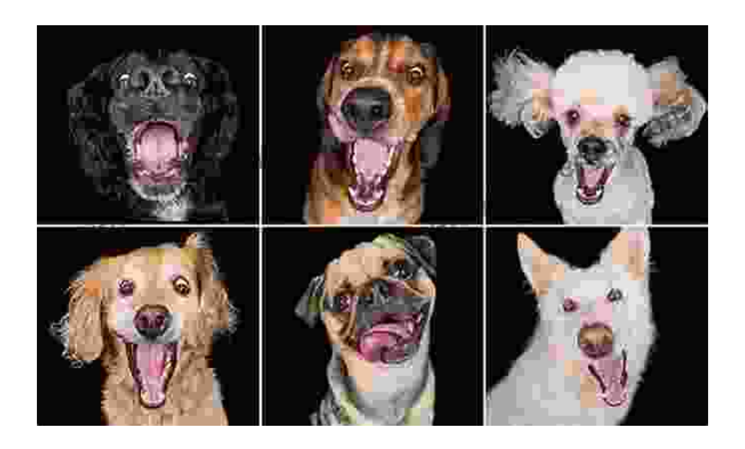
Chapter 4: Dogs and Cats in the Family:

When dogs and cats become part of a family, they add an immeasurable sense of joy and purpose. Author [Author's Name] examines the dynamic between these animals and their human companions, highlighting the unique role they play in shaping our families. The book provides practical advice on integrating dogs and cats into the family unit, fostering harmony and creating a supportive environment for all.